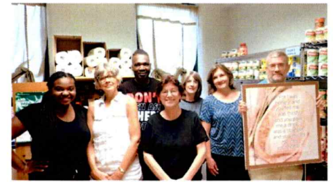
Plymouth's Food Pantry