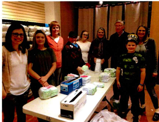
Plymouth ROCKS at the CNY Diaper Bank (Justice and Outreach Ministry)

Plymouth's Endowment Fund is a restricted fund in which the principal is held and invested in perpetuity. Each year on December 31 the fund is revalued, and a portion (usually 4%-6%) of the fund's value is distributed during the course of the following year to support Plymouth Congregational Church's ministries as well as its physical maintenance and repair.