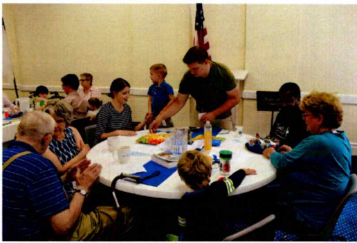
Sunday LIFT - Intergenerational Faith Formation